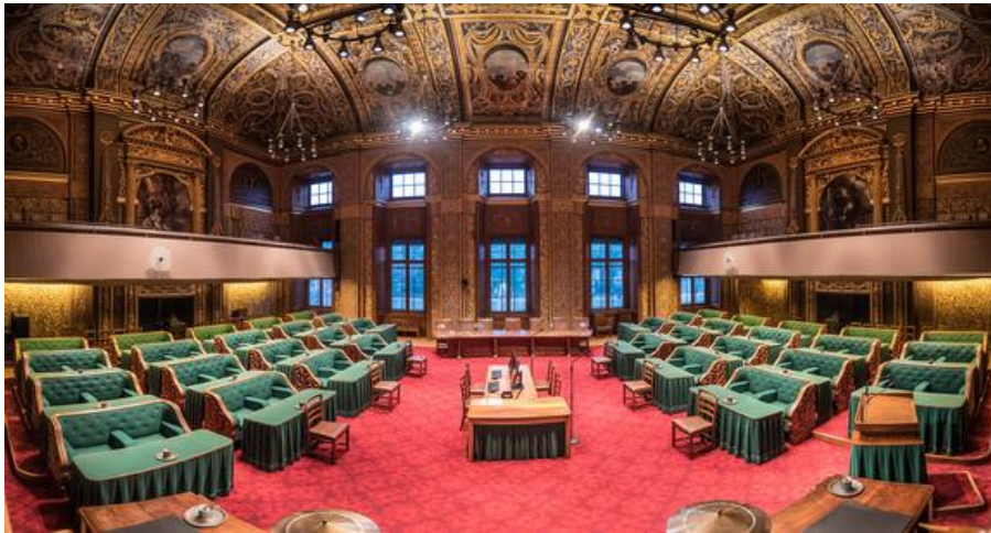
Senate (Eerste Kamer)