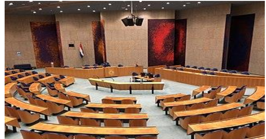
House of Representatives (Tweede Kamer)